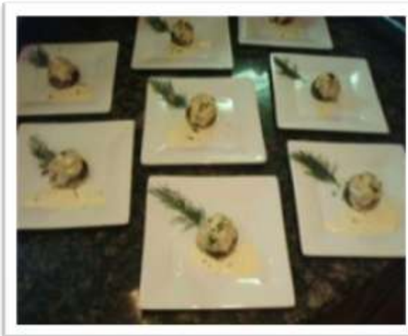
Crab Cakes with Tangerine Scented Beurre Blanc