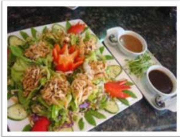
Thai Chicken Salad in Bib Lettuce Cups