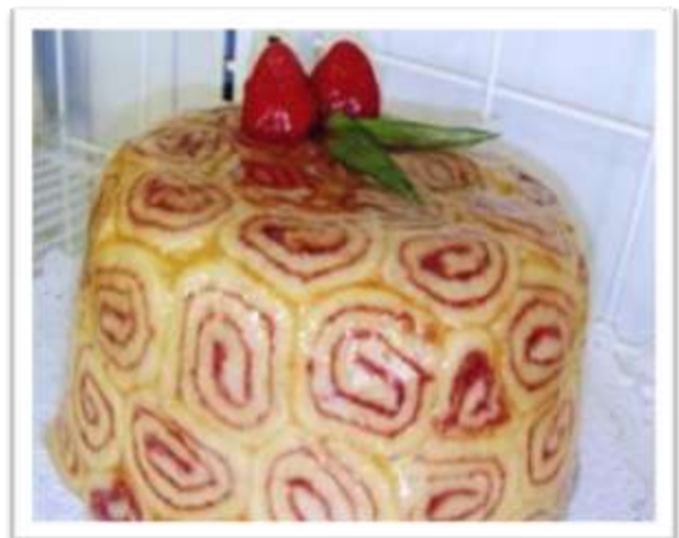
Ice Cream Filled Jellyroll Bombe