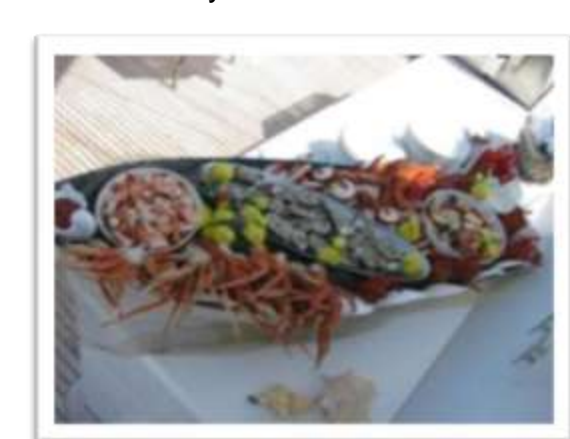
Fresh Seafood Platter