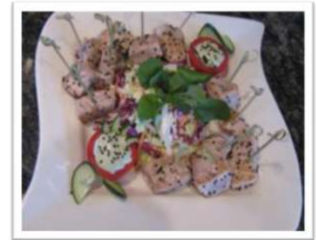
Grilled Ahi Bites with Wasabi Crème