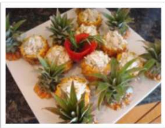
Crab Salad Stuffed Pineapples