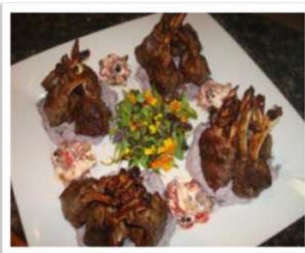
Rack of Lamb Platter for Dinner Buffet