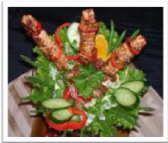
Skewered Grilled Tandoori Spiced Pork Tenderloins/Lunch Buffet Presentation