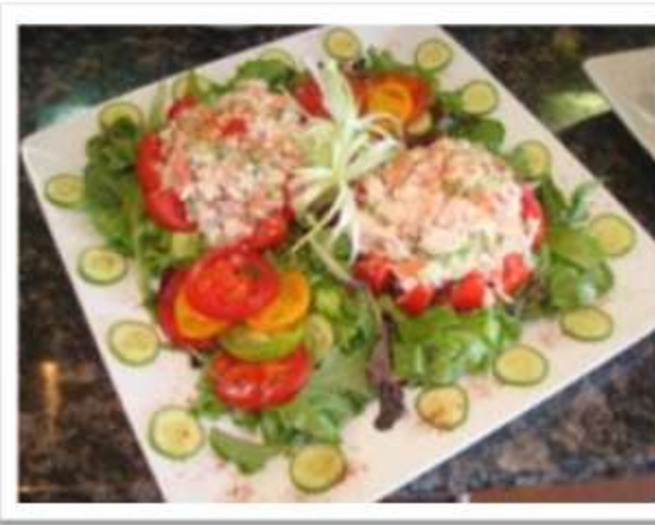
Shrimp Salad Stuffed Tomatoes