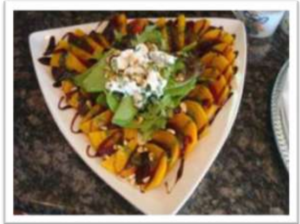
Cold Roasted Yellow & Red Beet Root Salad with Asiago Crème and Toasted Hazelnuts