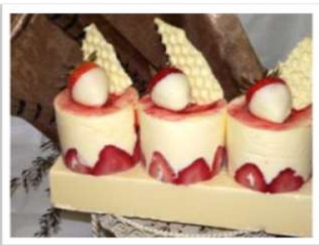
Individual StrawBerry Cheesecakes