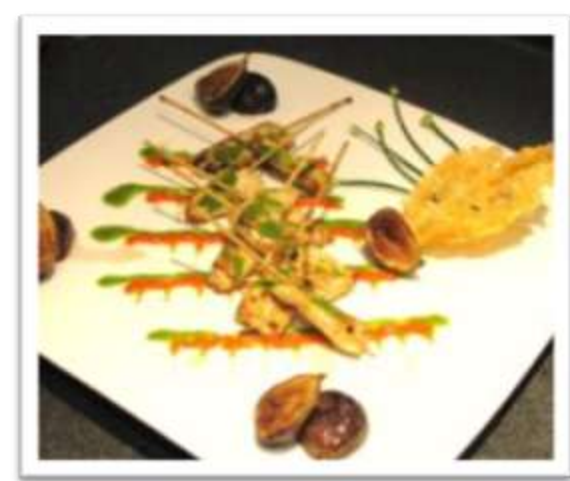
Teriyaki Chicken Skewers