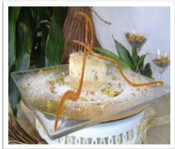
Individual Cocolate/Hazelnut Mousse and Pistachio Mousse Cakes (New Years Eve Dinner 2008)