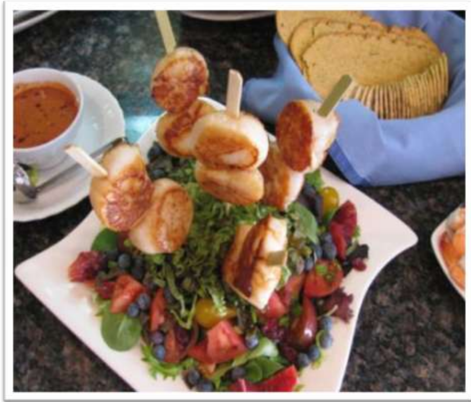
Grilled Scallop Salad Lunch Buffet item